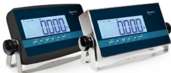
GI400 BAT LI-ION LCD